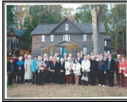
Group of members and guests outside the Louisa May Alcott Orchard House Museum Concord, MA at our November 6, 2011 meeting